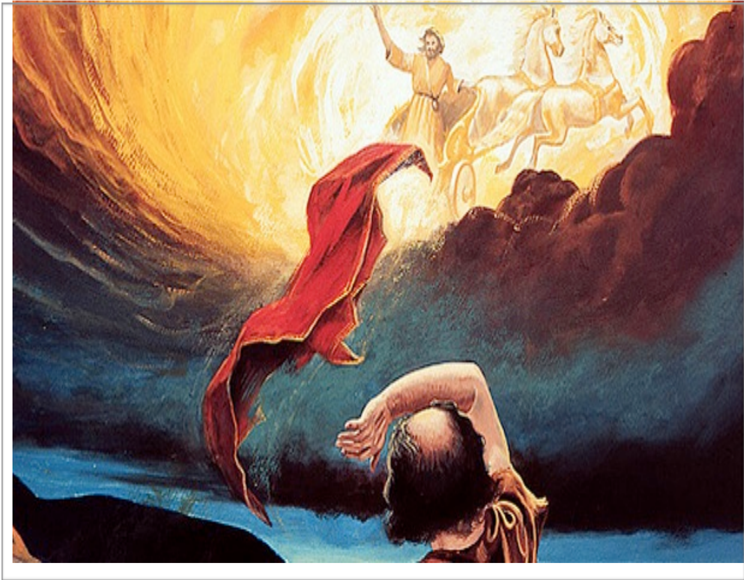
Elijah's ascension in the Chariot of Fire: